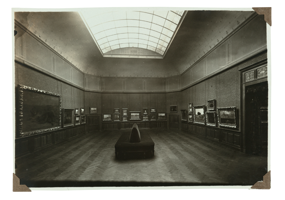
Fig. 32 Room 367 in the Drucker extension, Drucker-Fraser Collection in 1922. Photograph, 120 x 170 mm. Amsterdam, Rijksmuseum, inv. no. RMA-SSA-F-00017-1.

At the same time, appreciation of modern art in the Netherlands developed at a rapid pace and when, in 1909, the Rijksmuseum was able to obtain paintings by Vincent van Gogh, Paul Cézanne and others on loan from the Hoogendijk family and Van Gogh's heirs, it was deemed to be an excellent opportunity.63 In 1888 French Impressionists had proved to still be unsaleable, but now Post-Impressionists hung in the museum. The French realists of the Barbizon School, the Daubignys, Courbets and even the Monet were no longer classified as avant-garde.